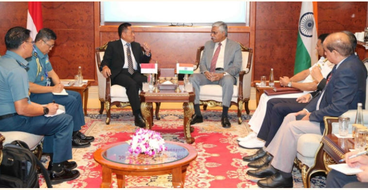
Cooperation Committee (JDCC) meeting in New Delhi on May 03, 2024.